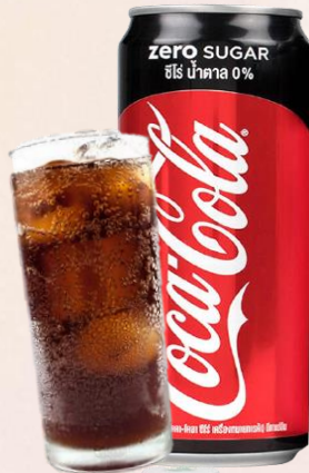
コークゼロ COKE ZERO Coca-Cola Zero No.137... 2$