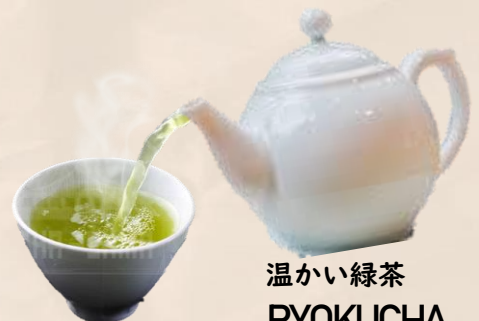
温かい緑茶 RYOKUCHA Hot Green Tea No.135... 3.5$

ボトル持ち込み Bottle opening fee ~900ml 10$/900ml~17$