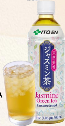
ジャスミンティー JASMINE TEA Cold Sweet Jasmine Tea No.134... 3$