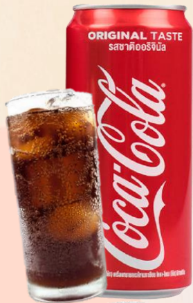
コカ・コーラ COKE Coca-Cola No.136... 2$