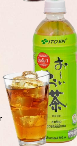
おーいお茶 COOI OCHA Cold Green Tea No.132... 3$