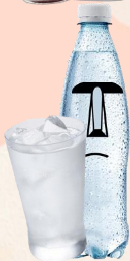
水 Mizu Drinking Water No.130... 1.5$