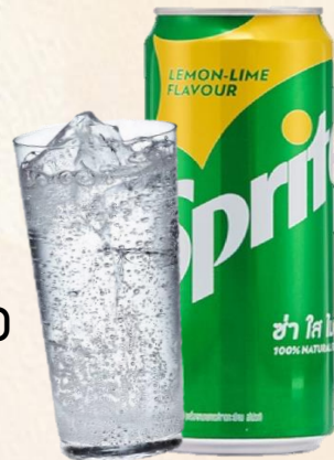
スプライト SPRITE Sprite No.138... 2$