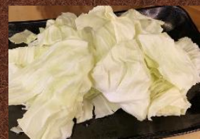
No.306 キャベツ KYABETSU 1$ Cabbage ត្រីប្រូតករោត