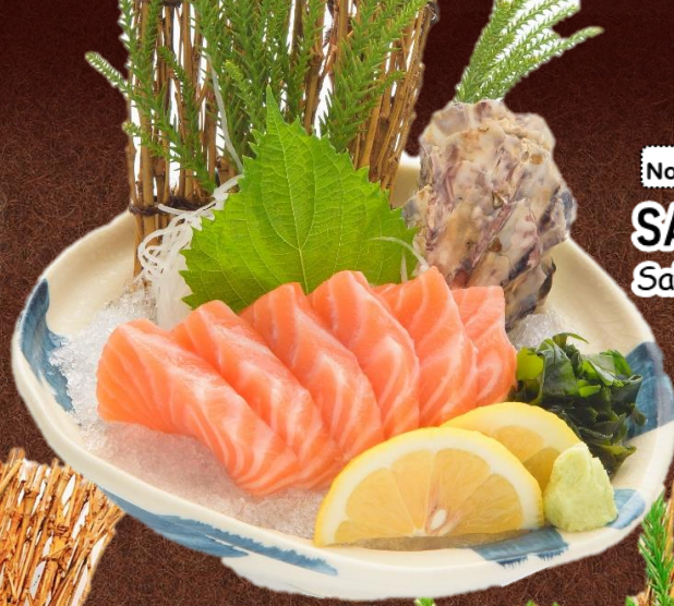
No.413 サーモン刺身 SALMON SASHIMI Salmon Sashimi សាម៉ុងសាស៊ីមី