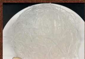
No.314 はるさめ HARUSAME 2$ Glass Noodles មីត្រូវលាប