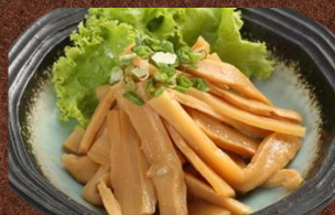
No.1206 メンマ MENMA 3.5$ Seasoned Bamboo Shoots ត្រពាំងជ្រូកបែបជប៉ុន