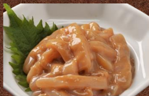
No.1221 塩辛 SHIOKARA 4.5$ Marinated Raw Squid with guts ជ្រូកដៃមីក