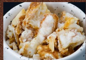
No.310 油かす ABURA KASU 5$ Deep-Fried beef innards ពោះគោតប៊ូនចៀង30g