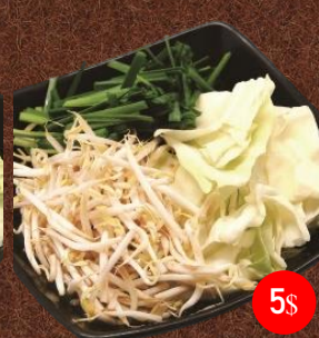
No.302 キムチもつ野菜 KIMUCHI MOTSU YASAI MORI Mixed Vegetables for Beef guts & Kimchi Hot Pot 5$