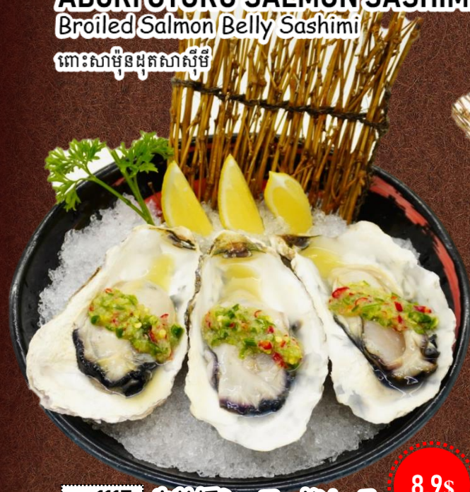
No.1117 生牡蠣シーフードソース KAKI SEAFOOD SAUCE Fresh Oyster With Seafood Sauce 3 pcs អយស្ទីរកោះកុង