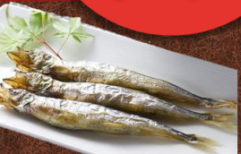
No.1227 ししゃも SHISHAMO 3.9$ Grilled Smelt ត្រីពងត្រីមីអាំង