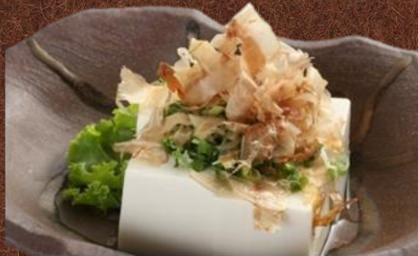
No.1212 冷奴 HIYAYAKKO 3.3$ Cold Tofu តៅហ្ស៊ីត្រជាក់