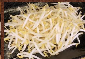
No.305 もやし MOYASHI 1$ Bean sprouts សរីរាណុកបណ្តុះ