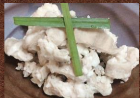
No.0300 モツ MOTSU 5.5$ Beef guts ពោះគោតប៊ូនស្នោរ