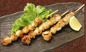
No.1211 イカ軟骨塩焼き IKA NANKOTSU YAKI 4.9$ Grilled Squid soft bone មាត់មីកអាំង