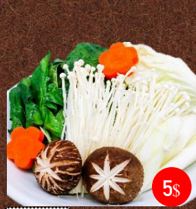
No.303 しゃぶ野菜 SHABU YASAI MORI Mixed Vegetables for Shabu Shabu 5$