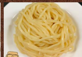
No.318 チャンポン麺 CHANPON MEN 2$ Chanpon Ramen Noodles