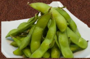
No.1209 枝豆 EDAMAME 3.5$ Boiled Green Soy Bean អង្កាមមែស្មៅអំបិល