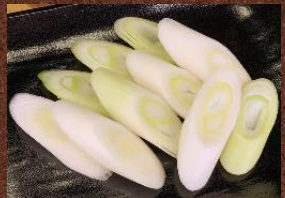
No.307 白ネギ SHIRO NEGI 1$ Japanese leek ដើមថ្លីមាត់ប៉ូន