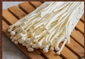
No.308 エノキ ENOKI 1$ Enoki mushroom ផ្លែធុតត្រូវលាប