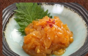
No.1223 中華くらげ CHUKA KURAGE 3.5$ Seasoned Jellyfish ជូតាការ៉ាគី