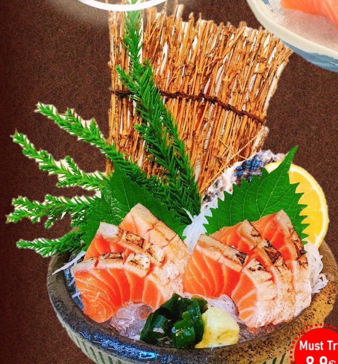
No.450 炙り大とろサーモン刺身 ABURI OTORO SALMON SASHIMI Broiled Salmon Belly Sashimi