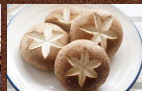
No.5157 しいたけ SHIITAKE 1.5$ Shiitake Mushroom ផ្លែធុត