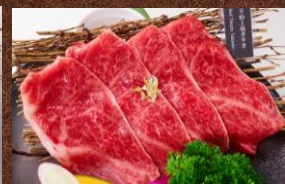
No.5006 馬場スライス BABA SLICE 18$ Wagyu A5 Premium Baba beef Slice