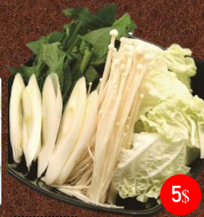
No.301 鶏豚鍋の野菜 TORI BUTA YASAI MORI Mixed Vegetables for Chicken & Pork Hot Pot 5$