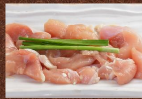
No.311 鶏肉 TORI NIKU 3$ Chicken សាច់មាន់