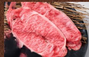
No.5011 和牛上スライス WAGYU JO SLICE 15$ Wagyu A5 Premium Baba beef Slice