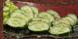
No.1202 胡瓜浅漬け KYURI ASAZUKE 3.3$ Pickled Cucumber ត្រសក់ជ្រូកបែបជប៉ុន