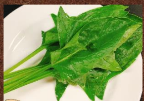
No.330 ほうれん草 HORENISO 1$ Spinach ត្រីប្រូតករោត