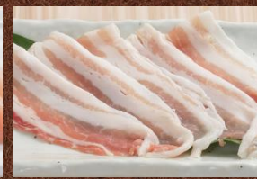
No.312 豚肉 BUTA NIKU 3$ Pork សាច់ជ្រូកបីដាច់