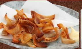
No.1219 エイヒレ EIHIRE 4.9$ Grilled Stingray Fin ត្រីដៀតបែបលាង