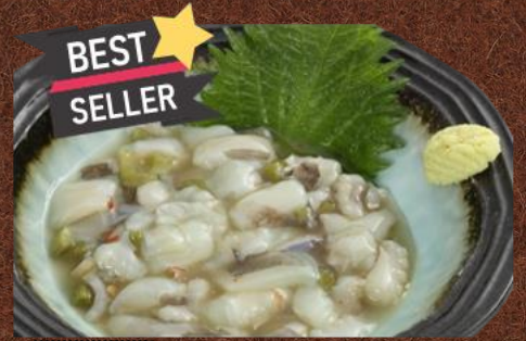
No.1210 たこわさ TAKO WASABI 3.9$ Raw Octopus marinated with Wasabi មីកជ្រូកវ៉ាសាប៊ី