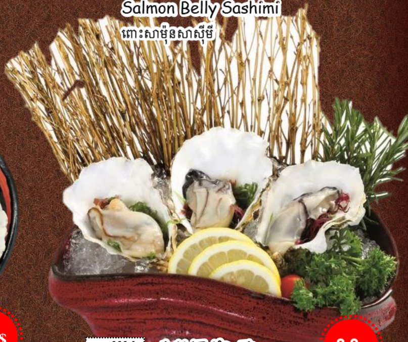
No.1116 生牡蠣ポン酢 NAMA KAKI PONZU Fresh Oyster With Ponzu Sauce 3pcs អយស្ទីរទឹកផ្សិត