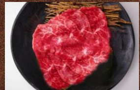
No.5009 和牛赤身スライス WAGYU AKAMI SLICE 17$ Wagyu Lean Silce