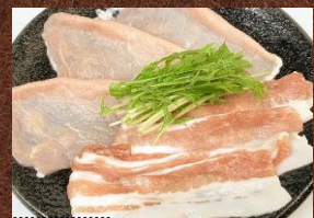
No.331 黒豚盛 KUROBUTA MORI 6.9$ Berkshire thin sliced Pork សាច់ជ្រូកគួរិវិគាហោងបន្លែដំឡើង