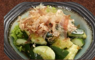
No.1207 ピリ辛胡瓜 PIRI KARA KYURI 3.5$ Spicy Pickled Cucumber ញ៉ាំត្រសក់ហ៊ីរ