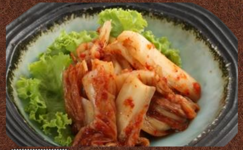
No.1205 自家製キムチ KIMUCHI 2.5$ Homemade Kimchi គីមឈី