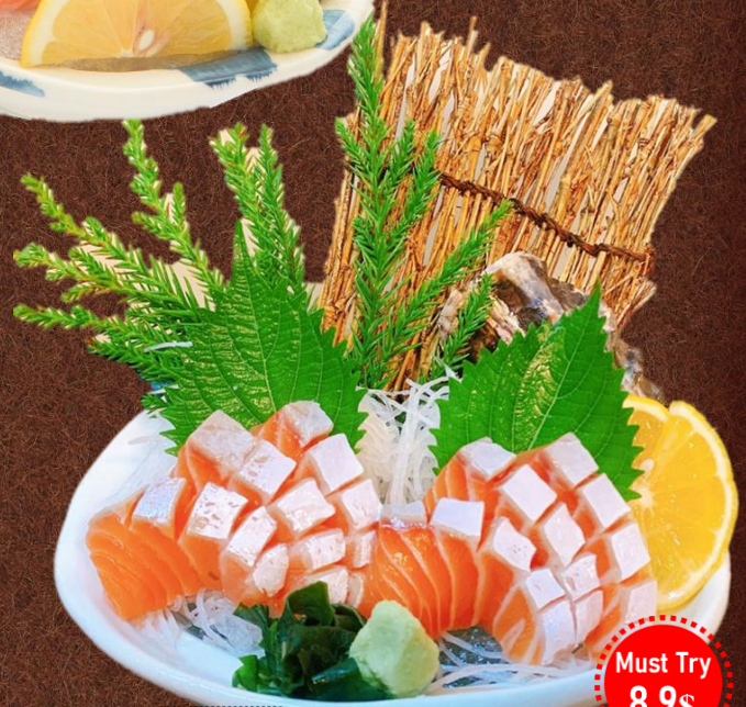
No.451 大とろサーモン刺身 OTORO SALMON SASHIMI Salmon Belly Sashimi