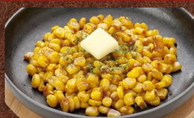
No.1225 コーンバター CORN BUTTER 3.9$ Butter Corn ពោតបំពងមី