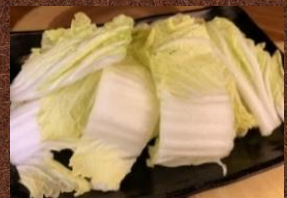
No.309 白菜 HAKUSAI 1$ Chinese cabbage ត្រីប្រូតករោត