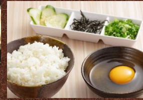
No.320 雑炊セット ZOSUI SET 3$ Make rice parried with soup in a pot ល្អិតតាមធម្មជាតិសម្រាប់បម្រើបរិយាយ