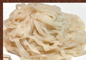
No.319 細いうどん HOSOI UDON 2$ Udon noodle Thin