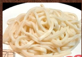
No.319 太いうどん HUTOI UDON 2$ Udon noodle Thick