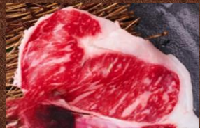
No.5007 サーロインスライス SARLOIN SLICE 14$ Japanese Beef Sirloin Slice