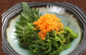
No.1222 中華わかめ CHUKA WAKAME 3.5$ Seasoned Seaweed ញ៉ាំសារ៉ាយសមុទ្រ