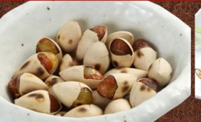
No.1218 银杏 YAKI GINNAN 3.3$ Grilled Ginkgo Nuts គីនណាម៉ាំង