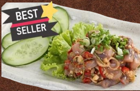
No.1220 ヤム塩辛 YUM SHIO KARA 4.9$ Marinated Raw Squid with Spicy Yam Sauce ញ៉ាំជ្រូកដៃមីកបែបថៃ